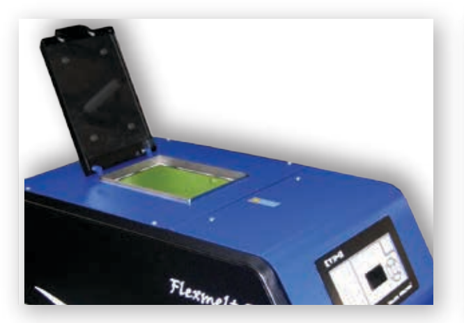
Ensure a reliable operation, minimize downtime and help reduce char buildup, while simplifying maintenance with our Teflon® coated tanks.